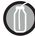
Glycol Bottle Probe