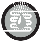
Automatic Stainless Steel Condensate Control System