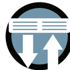
Front Breathing Refrigeration