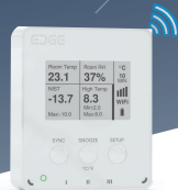
Embedded Digital Data Logger